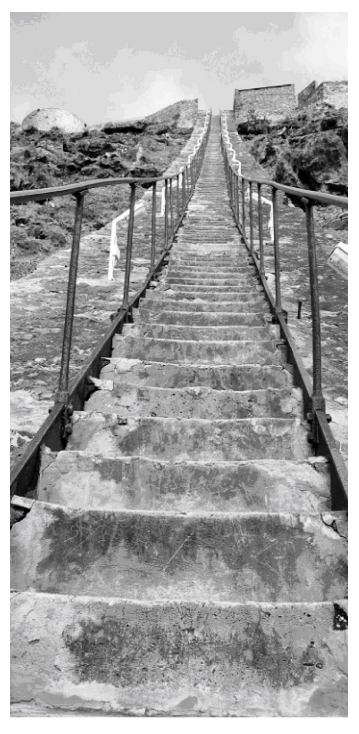
Jacob's Ladder, Jamestown